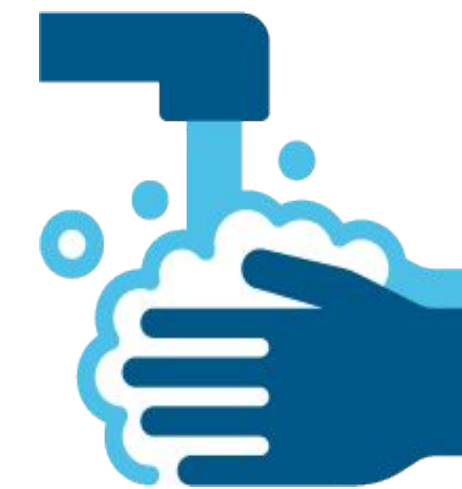
Good Hand Hygiene